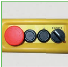
1.232.021 Basic remote control with hose reel and 50 m electric cable