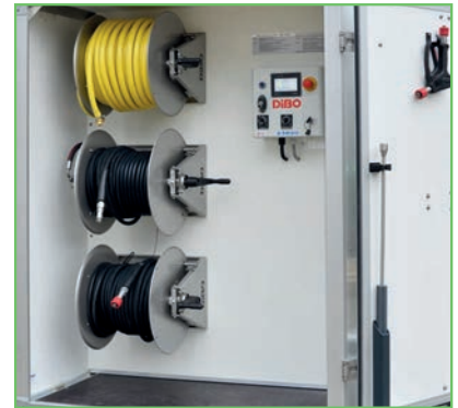
1.232.035 extra 3th hose reel (without hose)