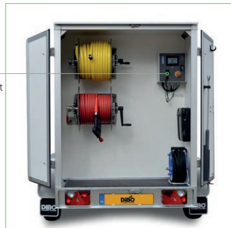
DiBO JMB-H 500/15

Everything visible at a glance. Easy to adjust with a handy joystick and to operate with gloves.