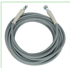
10 m high pressure hose (3/8") code: 1.653.020