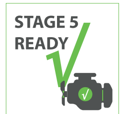
All engines comply with the latest emission standard