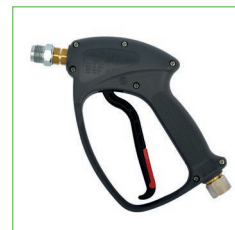
High pressure gun with swivel code : 1.211.525