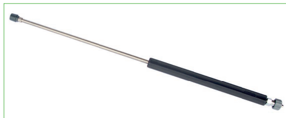
Single stainless steel lance with high pressure nozzle and rotating quick coupling code : 1.216.729.xxxx